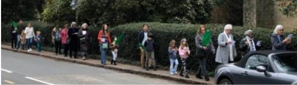
The Journey round the Church.....told in pictures