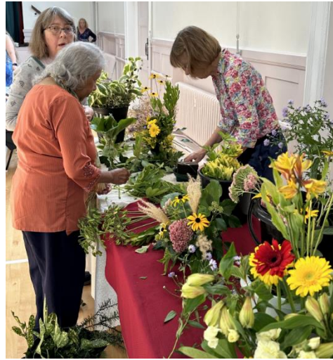
Harvest Flower Preparation

We were very pleased to welcome some budding flower arrangers when we set up a flower workshop at the Friday Café in September and asked people to make any arrangement that they liked for our Harvest displays in church. It was very rewarding to see the fun that people had in making the displays and the surprise that some of them had at the lovely displays that they had created. The church was full of a wonderful variety of flowers and greenery not forgetting all the people who came along to this exciting, busy service with all their harvest goods to share.