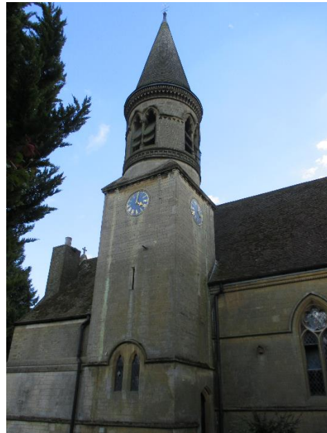
Church Clock Tower