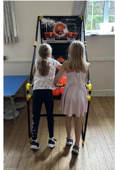
Enjoying Basketball Game