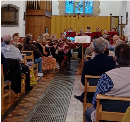
Classical Music Concert

In June we introduced a new event of Pimm's and Hymns where people were invited to nominate their favourite hymns to sing along to which was then followed by serving Pimm's, along with soft drinks, to enjoy. This proved to be a lovely social event and we have more planned for 2024.