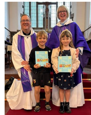
Admission to Communion