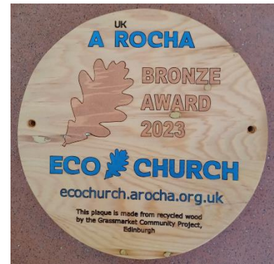
Eco Church Award

The PCC supports a number of local, national and international charities chosen each year for the following year. In 2023 the chosen charities were the Red Cross, Watford Mencap, New Hope and Action for Children. Additional grants were made to the Mothers' Union, Crisis UK, the Children's Society, Action for Children and Dementia UK. These grants were funded by donations at church services, post-service refreshments and the Friday drop-in Cafés. The total amount of donations given in 2023 was £3,905.89