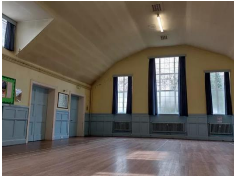
Hall Before Refurbishment

Many meetings were held to come up with an alternative plan to prioritise the work that was essential, and time outside meetings was spent writing job specifications, meeting with contractors to find out more about what each job entailed and then gathering quotes to compare. Each setback made us more determined to find a way to refurbish the Hall to the tight timescale