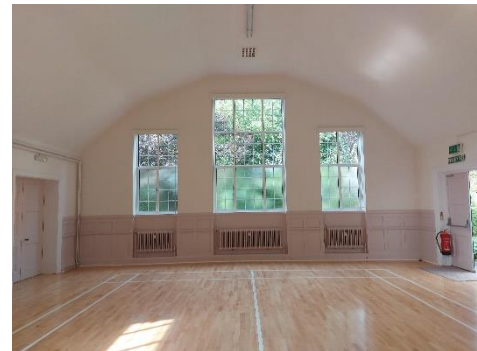
Hall After Refurbishment

Finally, we had chosen the contractors, chosen the colour scheme, completed all the relevant paperwork and had funds to begin. The preparatory work began in the last week of July so that decoration could begin at the start of August. There was a lot of problem solving along the way (some at very short notice) but week by week progress could be seen. After the ceiling, walls, woodwork and radiators had been painted and the new wall and ceiling lights had been fitted, the old floor was taken up and a new wooden floor was laid. What a transformation! The new curtains were hung a few weeks later, 100 new chairs were delivered and the Hall refurbishment was complete -nearly!