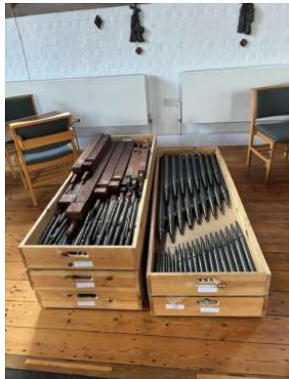
A selection of the pipes laid out in the north nave

needs by Cousans. An equivalent cost today would probably have been around £44,000, almost exactly that suggested by Cousans. In the event, none of that work was carried out. There was no appetite for the major fund-raising effort needed. A major review reporting to the PCC in 2018 produced no change in the decision of 30 years earlier and the instrument has continued its downward path. That path will now be halted and reversed by the work carried out by Cousans and which is intended to have been completed ready for the coming Christmas.